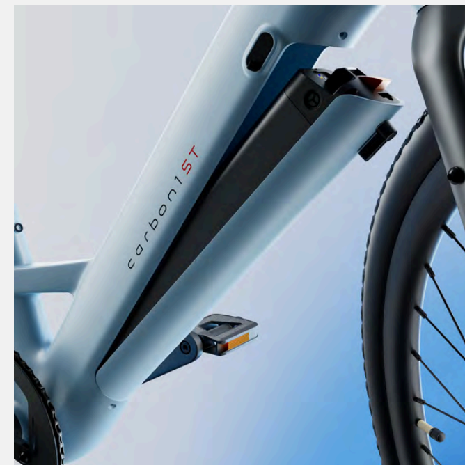
Removable Battery IP65 Certified