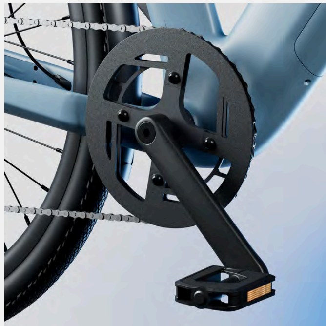
Torque Sensor Ultra-Smooth Riding