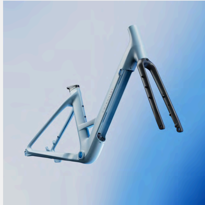
38 lbs Lightweight Toray® Carbon Fiber