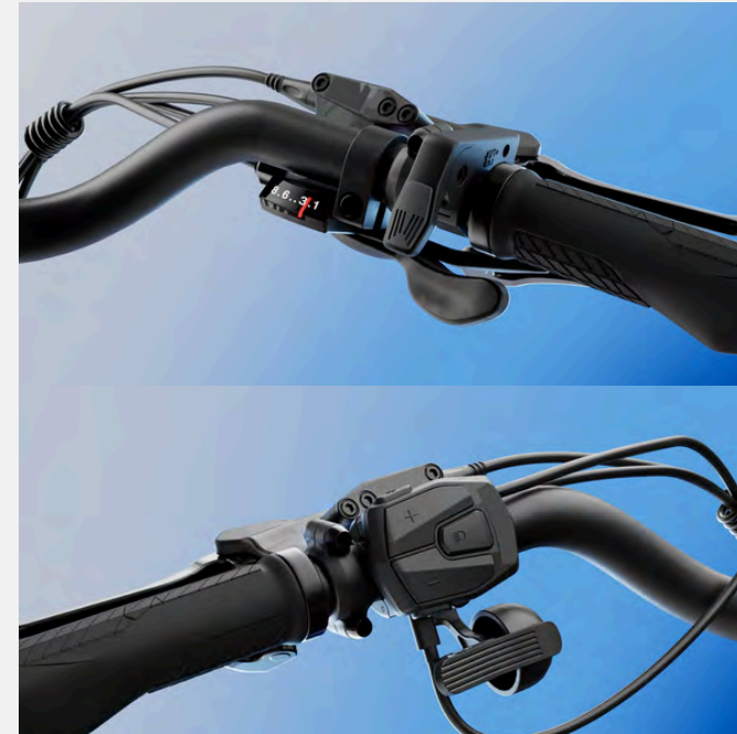
Throttle & Pedal Assist w/ Type-C Charging Port