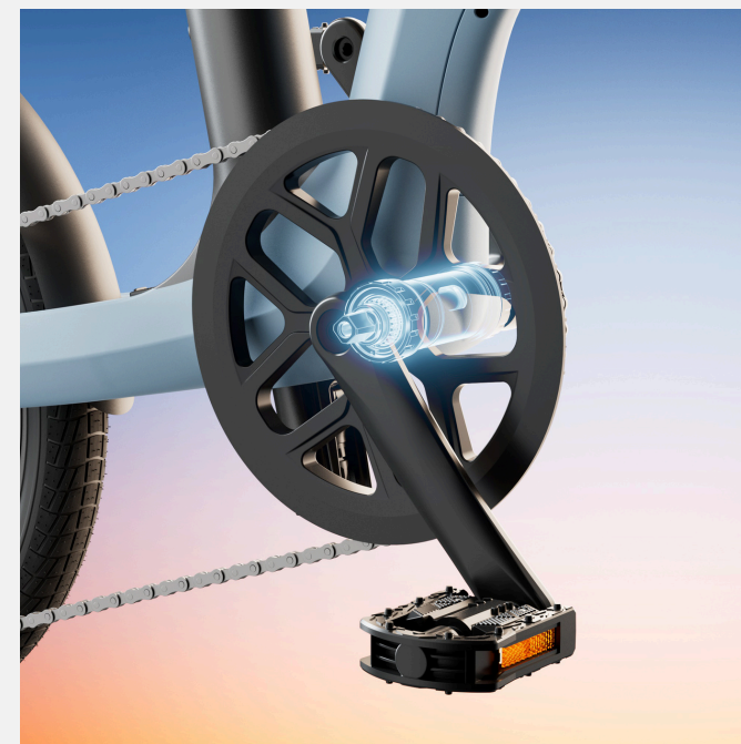
Torque Sensor Ultra-Smooth Riding