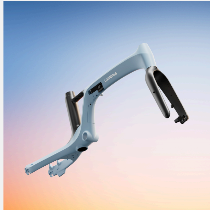
Toray® Carbon Fiber Both Frame and Fork

Dual battery compatibility folding e-bike