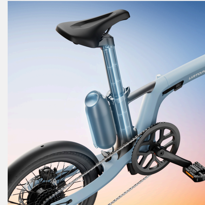
Long Range Dual Battery Compatibility