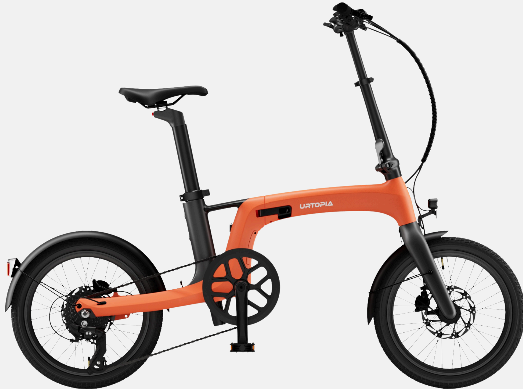
ORANGE (Pantone 1645C)

Dual battery compatibility folding e-bike