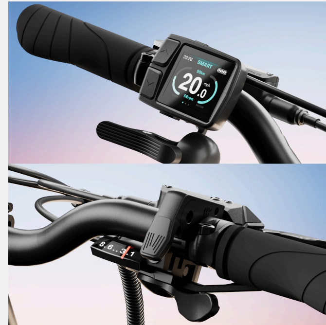
Throttle* & Pedal Assist w/ Type-C Charging Port