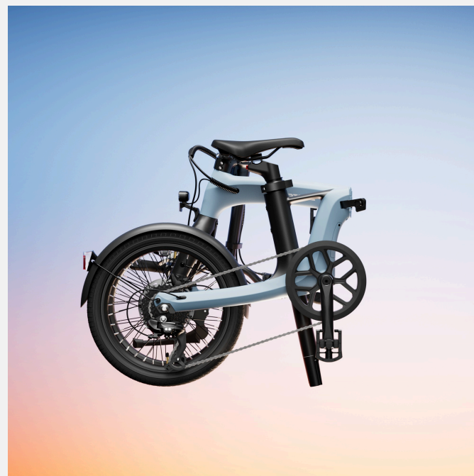
Space-efficient 2-Step Folding