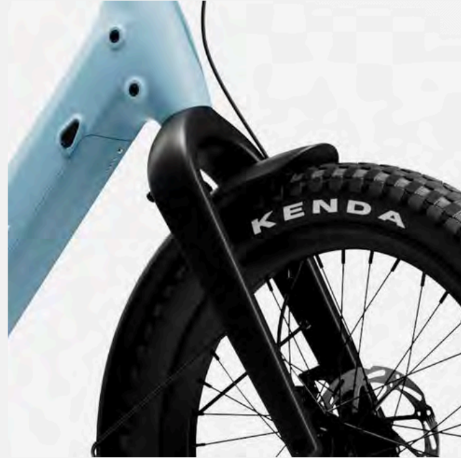
Toray® Carbon Fiber Both Frame and Fork