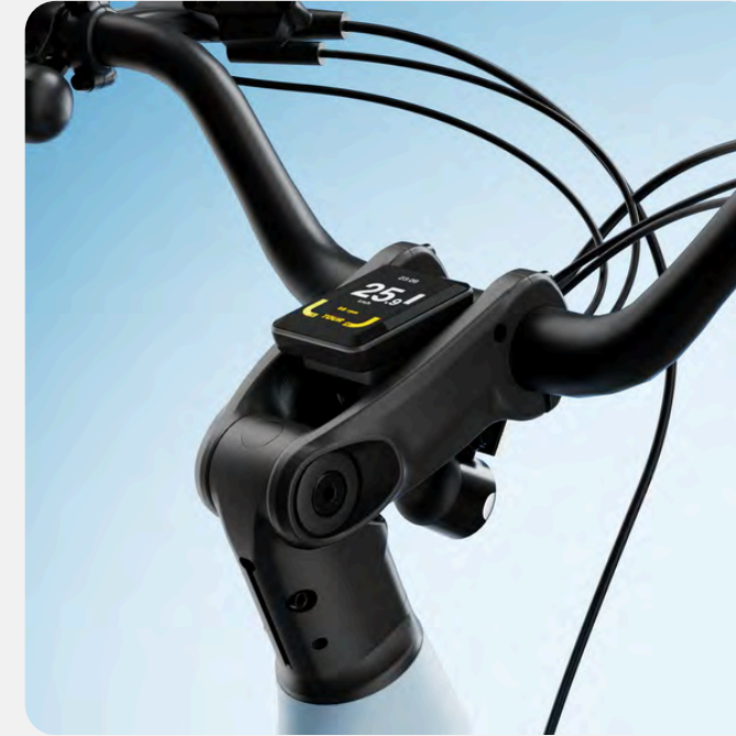
Adjustable Handlebar Built-in Color LCD Display