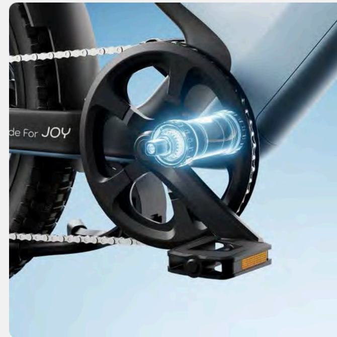
Torque Sensor Ultra-Smooth Riding