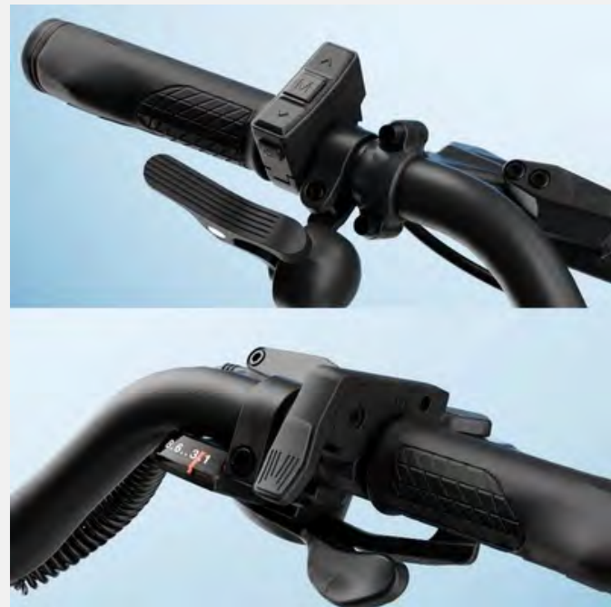
Full Throttle and Pedal Assist