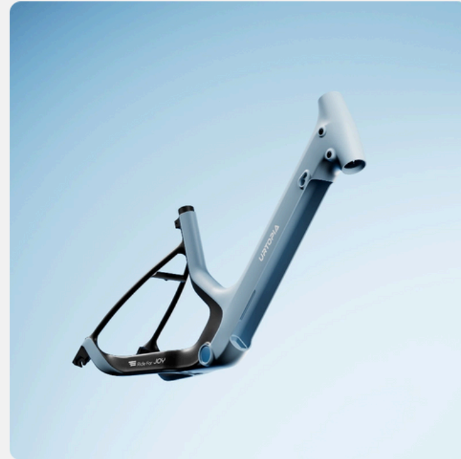
Carbon Fiber Frame Lightweight Step-Through