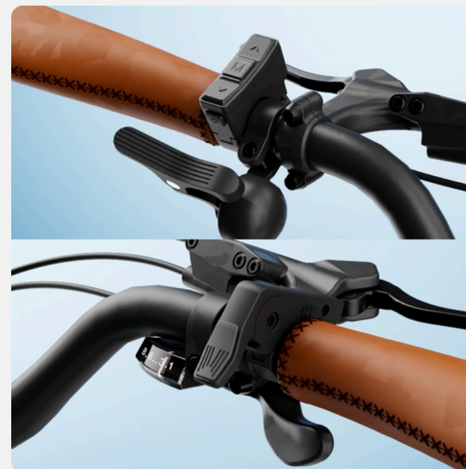
Full Throttle and Pedal Assist