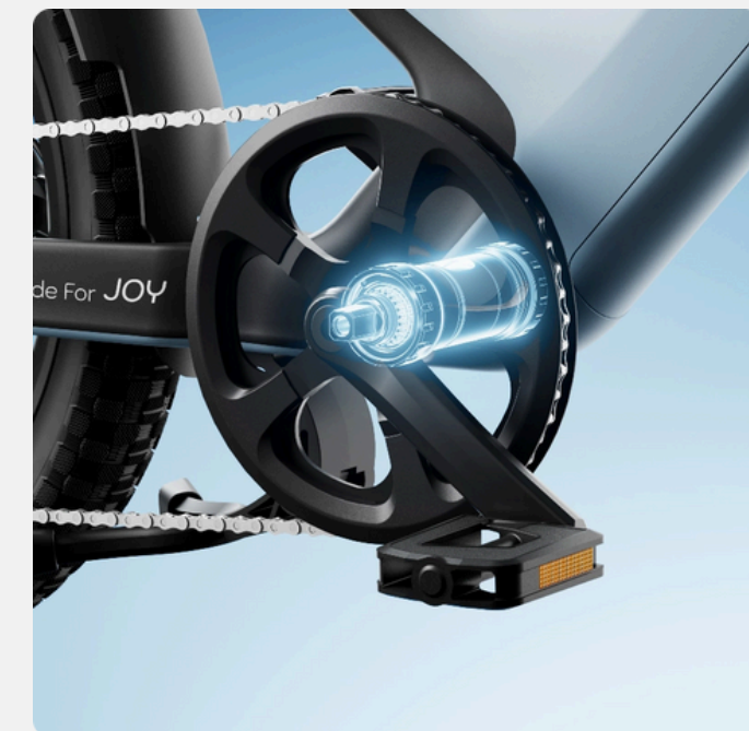
Torque Sensor Ultra-Smooth Riding