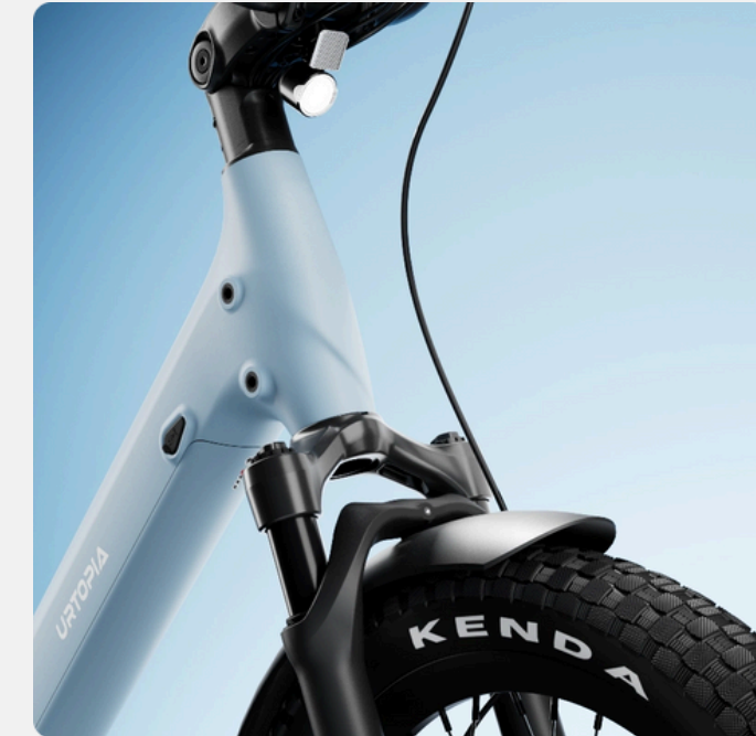
Comfort Ever Suspension Fork & Cushioned Saddle